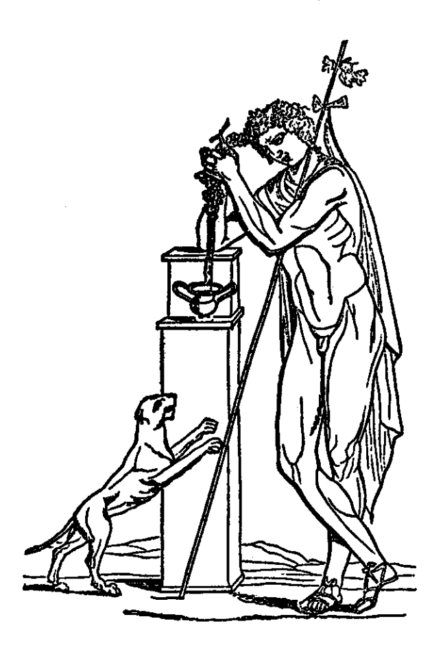
A singular proof of the ancient usage of squeezing the juice of grapes into a cup has been exhumed at Pompeii. It is that of Bacchus standing by a pedestal and holding in both hands a large cluster of grapes, and squeezing the juice into a cup . See page 64.